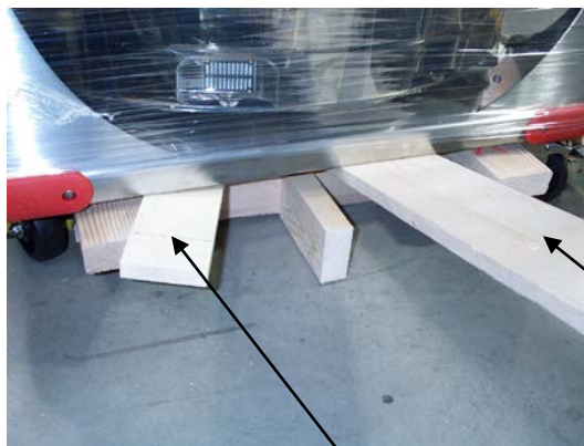
1 x 6 used as a pry bar