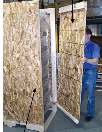
3. Remove each side panel, one at a time.