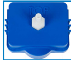
Figure 3: Front nozzle