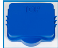
Figure 4: Front cap