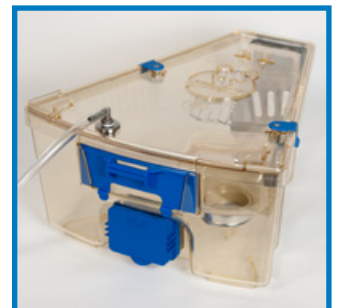
Figure 5: Inhalation Cage Top with Two Caps