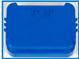
Figure 2: Rear cap