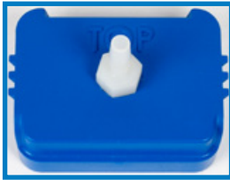
Figure 1: Rear nozzle

The Optimice inhalation nozzle and cap can be used to administer or scavenge gases.