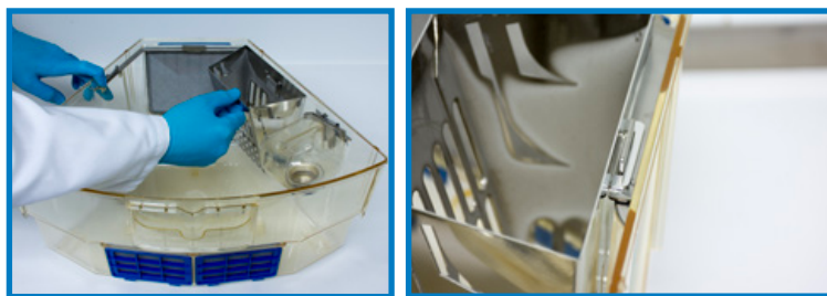
Figure Set 2